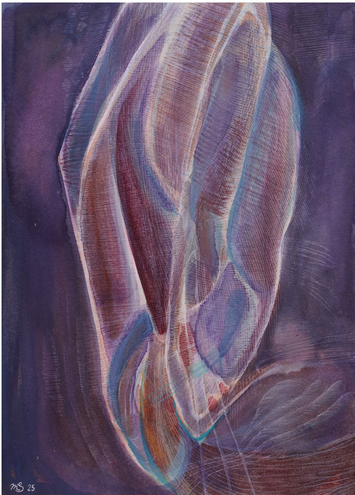
A0900 Alive Light Series 23 x 32,5 cm Mixed media on paper 2025 167 €