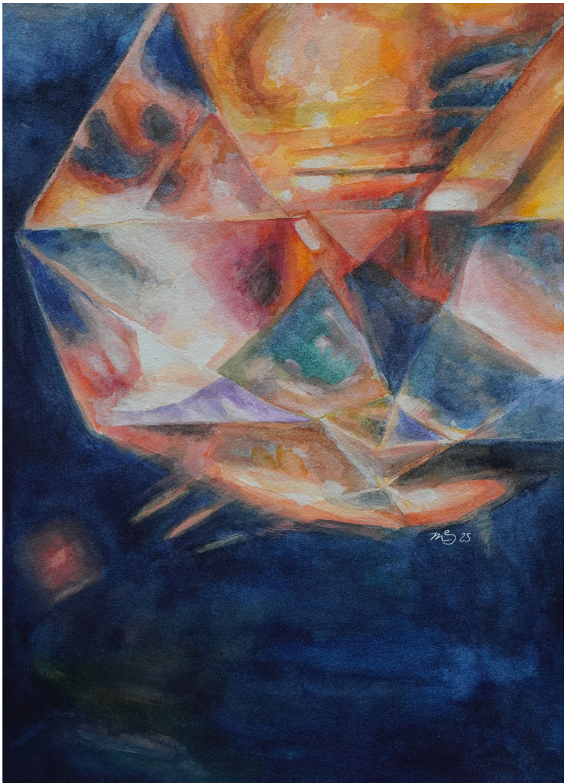
A0903 Alive Light Series 23 x 32,5 cm Mixed media on paper 2025 194 €