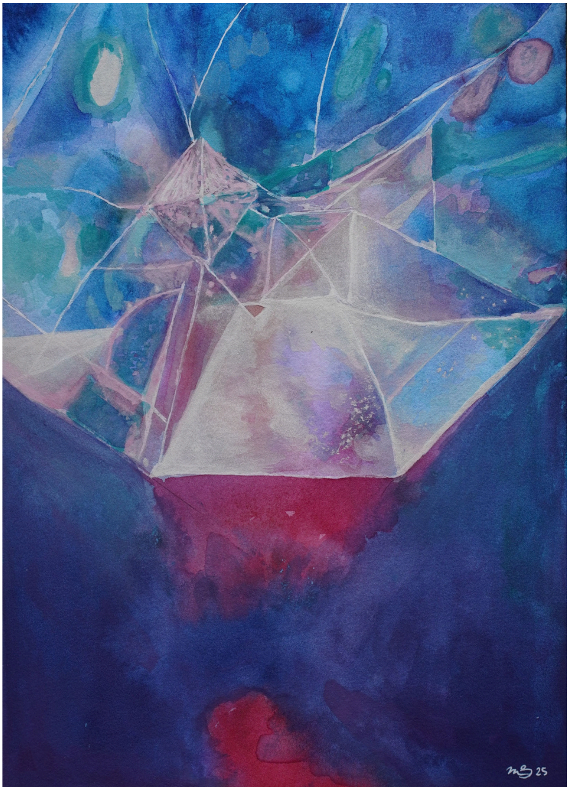
A0902 Alive Light Series 23 x 32,5 cm Mixed media on paper 2025 185 €