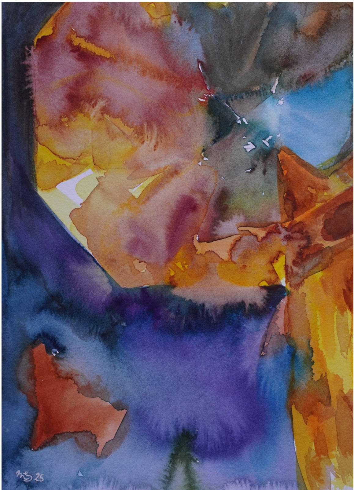
A0901 Alive Light Series 23 x 32,5 cm Watercolour on paper 2025 122 €